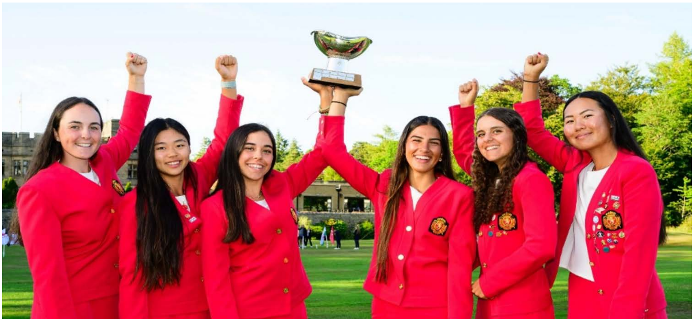
Picture 4: Defending Team Champion: Spain.