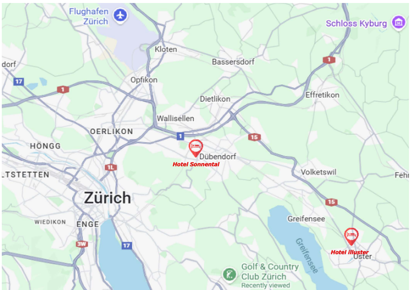
Picture 3: Map showing the main points of interest.

On the first (and last) day, we will arrange for a bus to pick you up (and drop you off) at Zurich International Airport. As you can see on the picture 3, both hotels are near the airport. An official shuttle for each hotel will be scheduled to take you to the golf course in the morning and back to the hotel in the afternoon / evening.