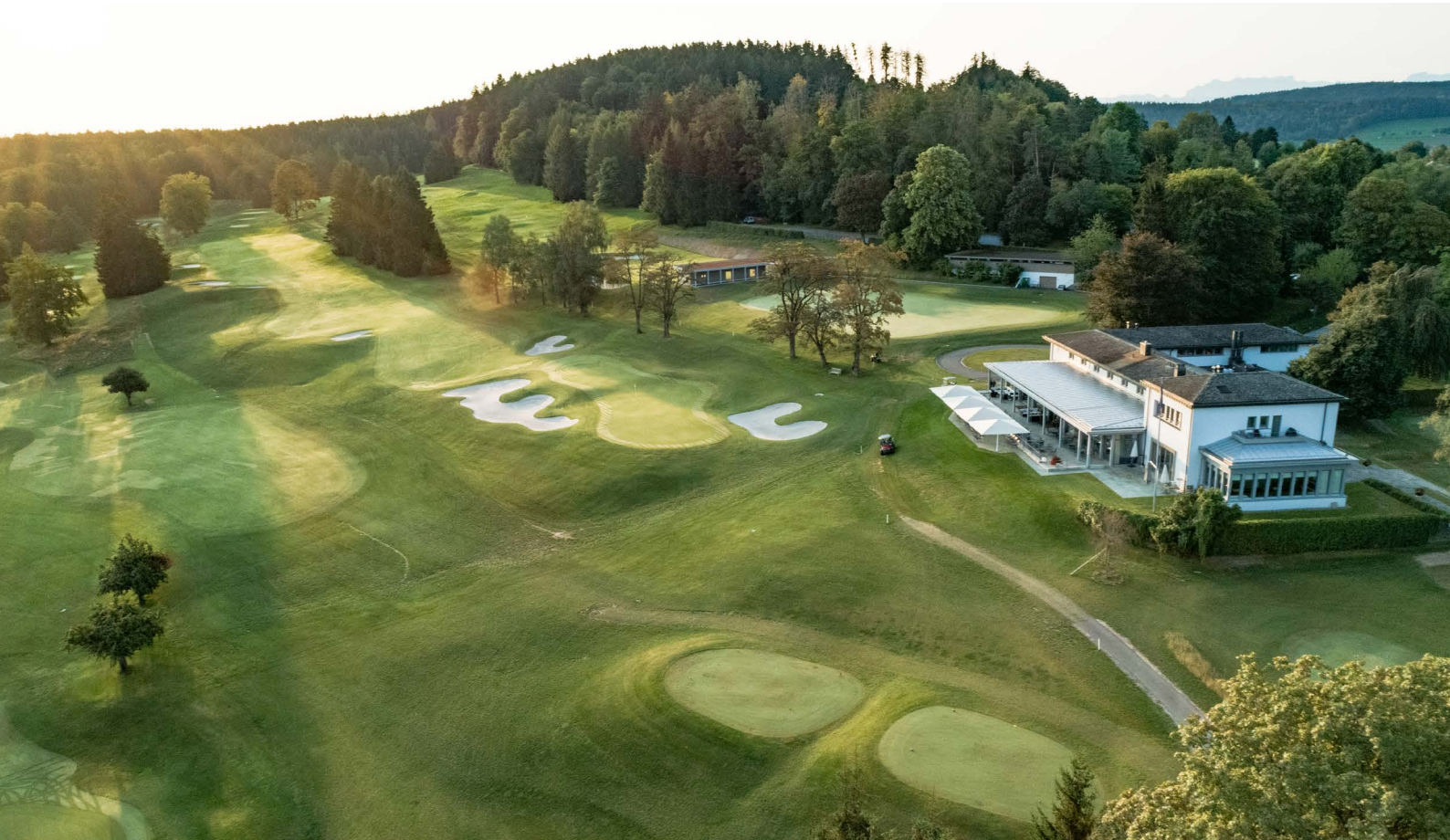
Picture 5: Golf Course view with the Club House on the right.