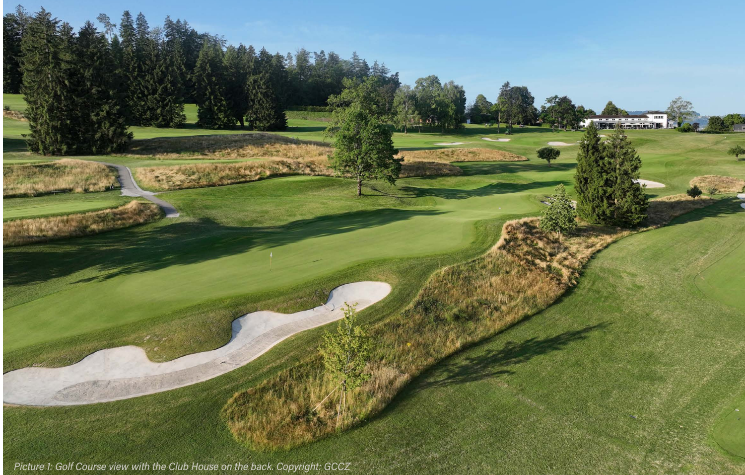
Picture 1: Golf Course view with the Club House on the back.