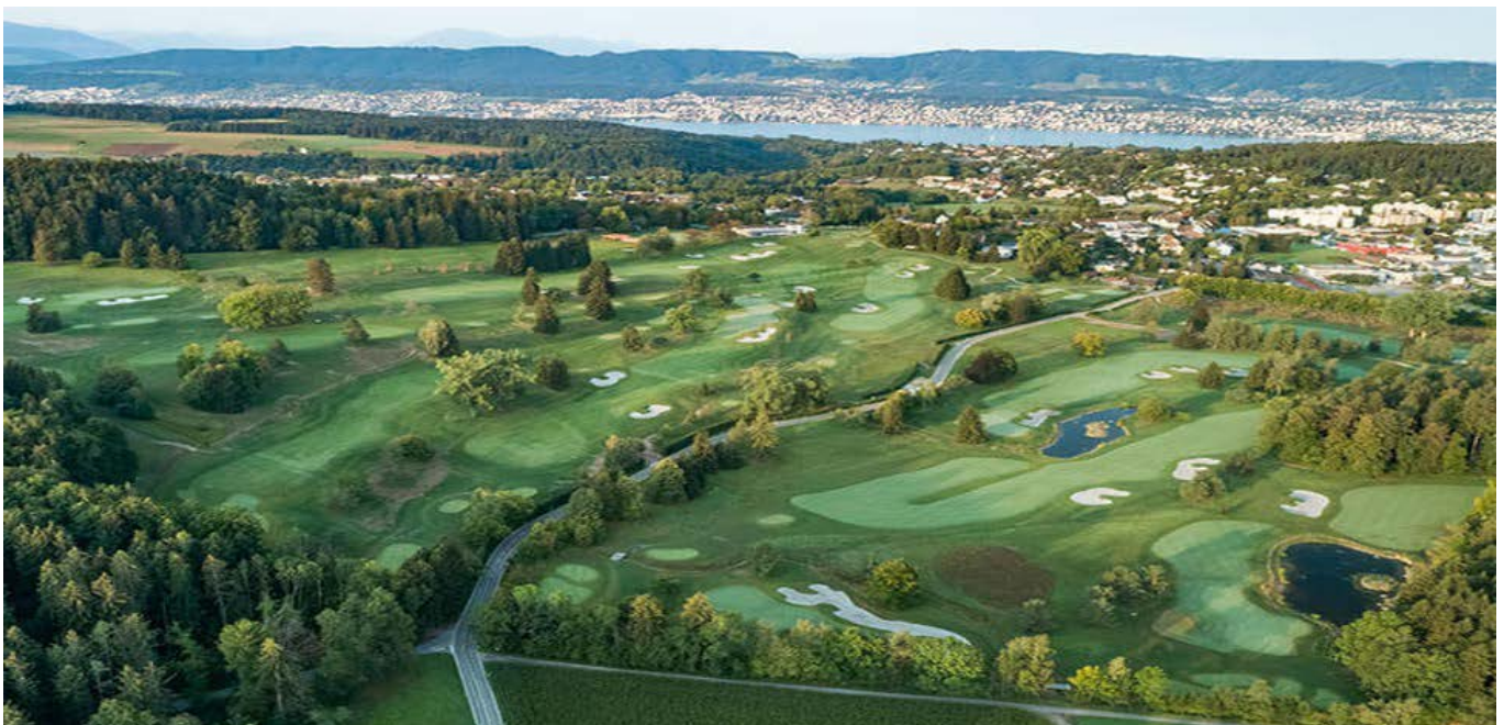
Picture 2: The golf course seen from above

Beyond golf, the clubhouse, designed in the 1930s in the Bauhaus style, is a distinctive venue that houses a very high-class restaurant. Although it is a private club, visiting players are generally welcome to play on weekdays. The GCCZ bravely accepted to host the European Amateur Championship in 2020 at the last minute following the upheavals caused by the coronavirus. The club co-organises the "Zürcher Meisterschaft" every year, as well as other major tournaments on a regular basis.