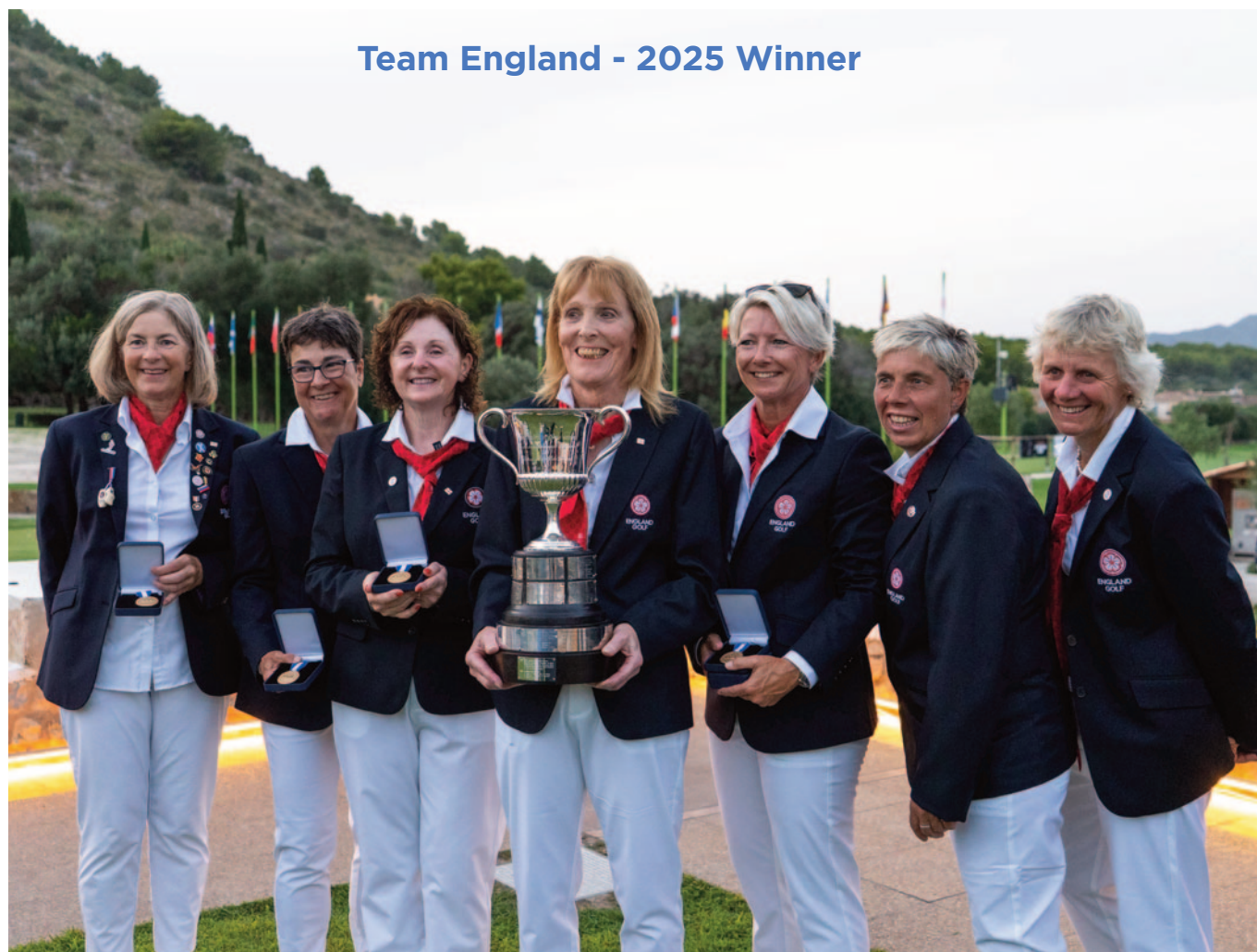
Team England - 2025 Winner