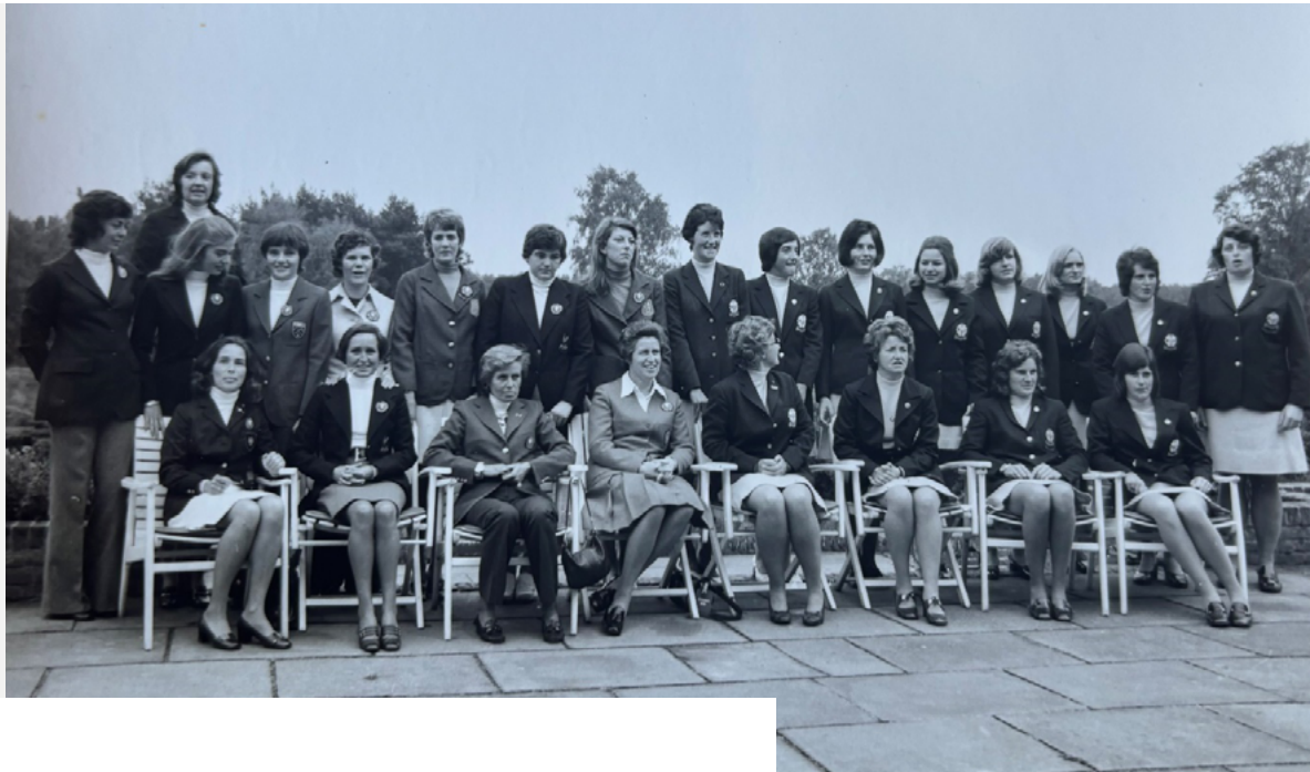
1973 on the Eindhovensche Golf