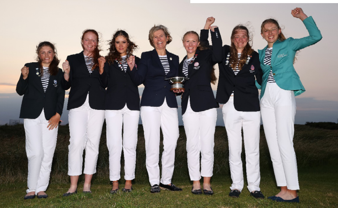
Winners Junior Vagliano Trophy 2024 Great Britain & Ireland