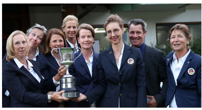
At the Estonian G&CC (Estonia), Sweden defeated England at the 3<sup>rd</sup> extra hole in the decisive match for the title.

At Arboretum GC (Slovenia) the Ladies' event was won by Germany.