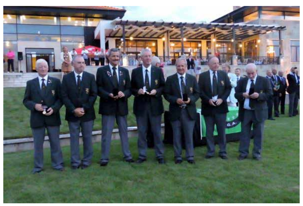
Irish Winning Team 2015