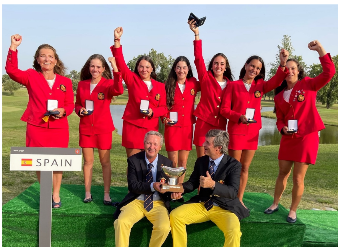
Defending Champions - Spain