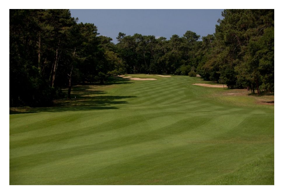
Hossegor – 15 Hole