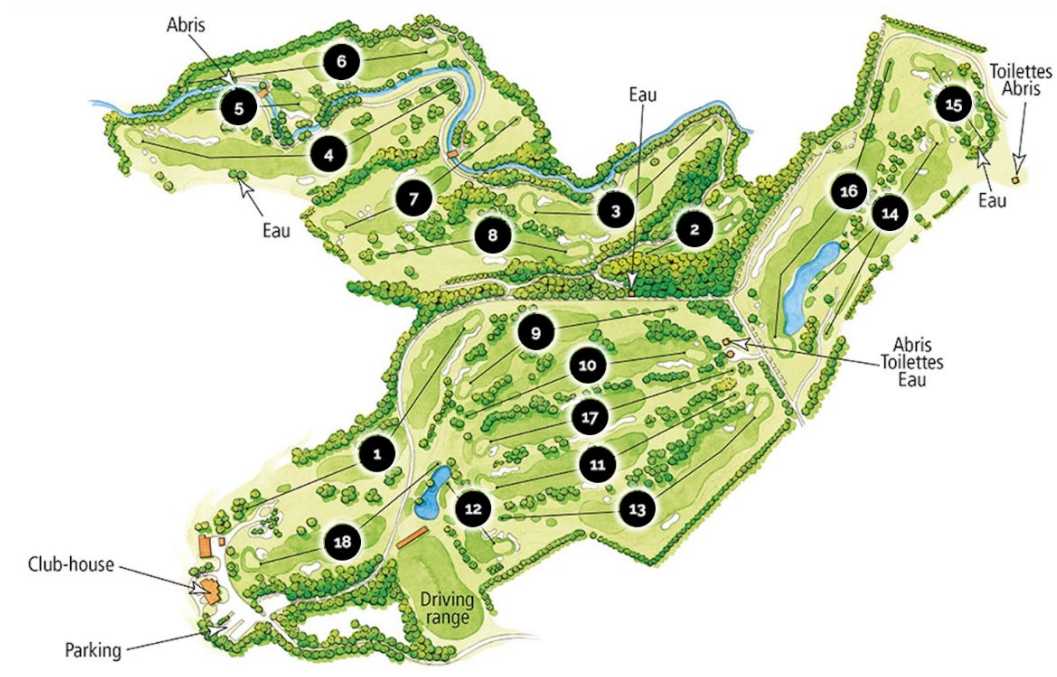
Golf Club Domaine Impérial – Layout