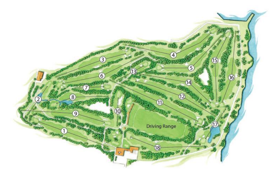
Golf Ascona - Layout