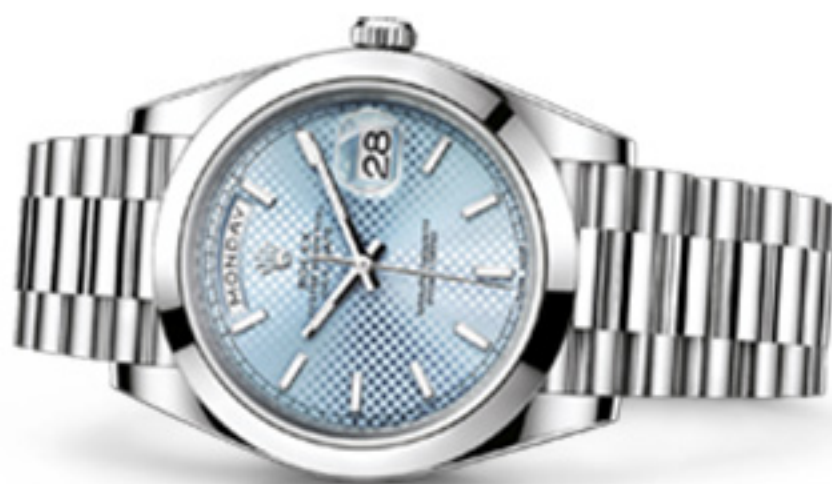
OYSTER PERPETUAL DAY-DATE 40 IN PLATINUM

THIS WATCH HAS SEEN TIMELESS TRADITIONS. AND LEGENDARY EXCELLENCE.