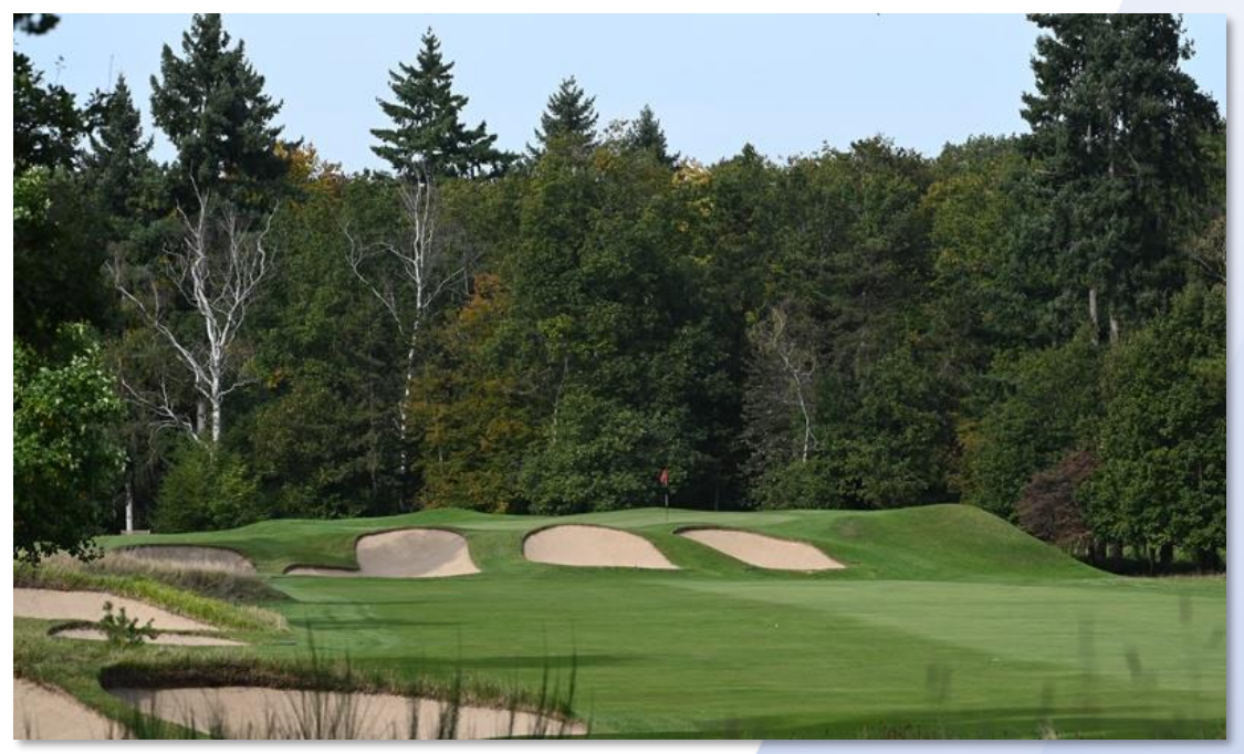
The Golf de Saint-Germain - Hole 10 - Green