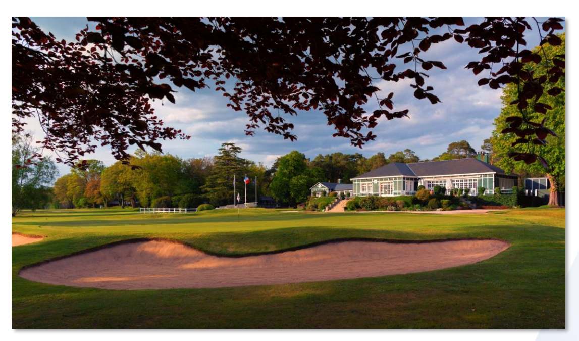
The Golf de Saint-Germain - Hole 9 - Green