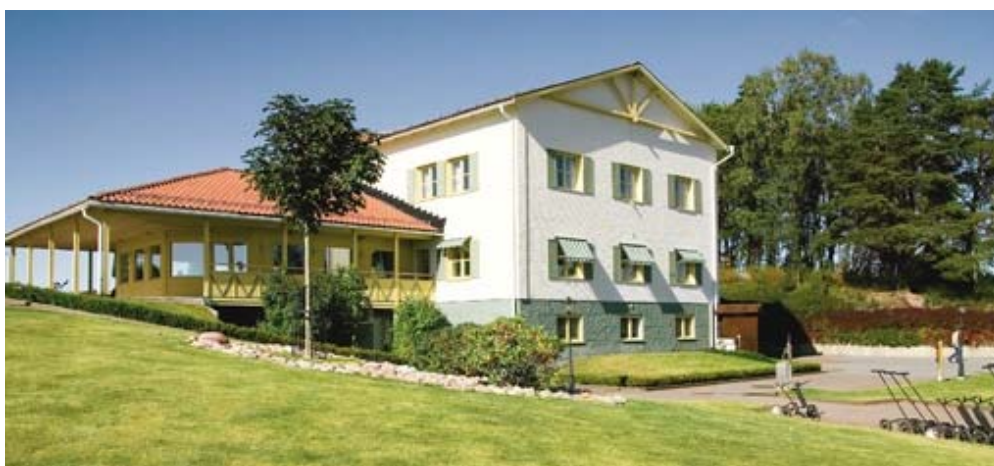
Österåkers GC – the club house

Please note: Details about departure times etc. will be posted on the official notice boards.