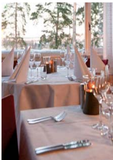
Breakfast & dining