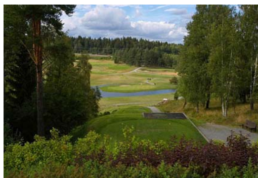
Hole 7 – par 3