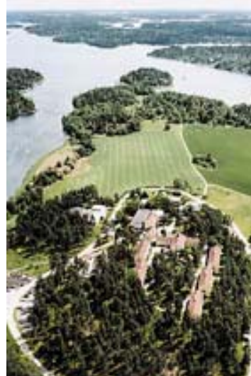
Overview – Runö by the Baltic Sea

Runö - Conferences & Events is located only 8 minutes drive away from Österåkers Golf Club on a peninsula of its own and neighbouring Trälhavet, by the Baltic Sea. Situated among beautiful natural surroundings, there is plenty of room for both large and small meetings, everything from our flexible 800-square-metre event hall to smaller meeting rooms in creative colours.